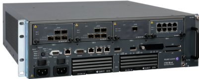
Alcatel-Lucent 7750 SR-c4

The 7750-SR-c4 is available beginning in mid-2010. Like its 7750 SR-c12 companion, the Alcatel-Lucent 7750 SR-c4 is a carrier-grade, 90 Gb/s (half-duplex) multiservice router optimized in scale and dimension for smaller network deployment needs. At just slightly over 3 RUs in height, the SR-c4 is more compact in size while also leveraging Alcatel-Lucent's award-winning FP2 network processor.