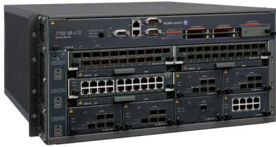
Alcatel-Lucent 7750 SR-c12

The 7750 SR-c12 is a 90 Gb/s (half-duplex) carrier-grade IP/MPLS router optimized for the high-performance routing and service-delivery needs of smaller operators. The SR-c12 is 5 RUs in height and leverages Alcatel-Lucent's award-winning FP2 network processor to provide advanced features, performance, and services with extreme quality delivery. The SR-c12 supports up to 12 subscriber interface slots that can be flexibly configured with up to eight Compact Media Adapters (CMAs), up to six Media Dependent Adapters (MDAs), or a combination of the two. CMAs are